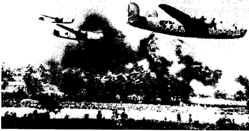
B-24 Liberators over Ploesti Oil Fields

Sir Winston Churchill called Ploesti, Romania, "the taproot of German might," because this is where the Nazi Third Reich obtained much of its oil. Five oil refineries circled the city—Ploesti was "the premier oil target of the continent"—thus one of Europe's most heavily defended cities. According to World War II historians, Ploesti will always be a symbol of surpassing bravery in air warfare.